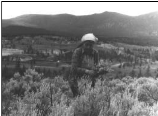
Woman collecting plants. Through family and community history research you can learn a lot about the lives of people in your family and community, including how they used the land.

Begin by asking questions of your immediate family and then move backwards through time. Most of the information you need for family history exists in your community. Cultural knowledge and history is alive in the memories and experiences of your community members. Depending on the goals of your project, you may be looking for the following kinds of information about family members: