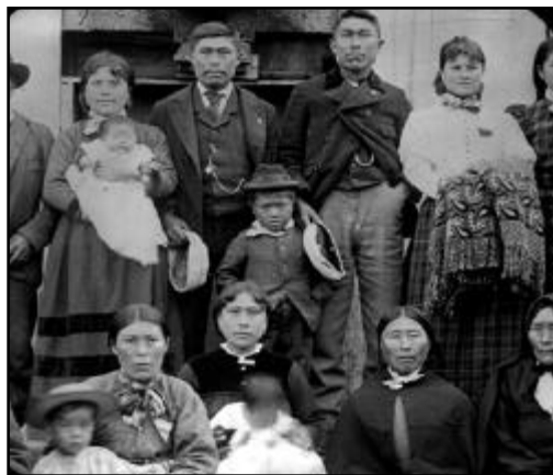
Descendants of Chief Clalamin, Bella Coola, c. 1890s. BC Archives G00962

Family history research is obviously more personal than other types of research. You may discover information that has not been widely discussed in your family or community. You may uncover information that is potentially painful or sensitive. All family and community research should be conducted ethically and responsibly, following all local protocols established by the community.